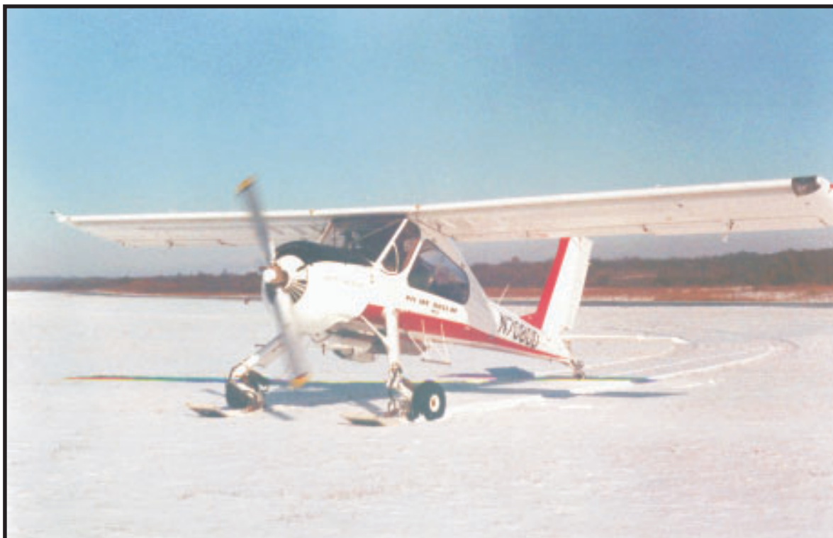
Paul Jennings' 1993 PZL-104 Wilga 80 on its "liftable" skis. Note the adjustable cowling shutters.

As imagined, I was limited to a small list of airplanes to choose from. Previously, I had owned and flown a 150-hp Super Cub from the strip and it did very well. However, I wanted to carry more than one passenger, so a four-place airplane was in order. I also wanted it to have excellent visibility from all seats. This stringent set of criteria narrowed the selection down to only four airplanes: a deHavilland Beaver (way too expensive), a Fieseler Storch (nearly impossible to get parts for), a Maule (a good possibility), and a Wilga.