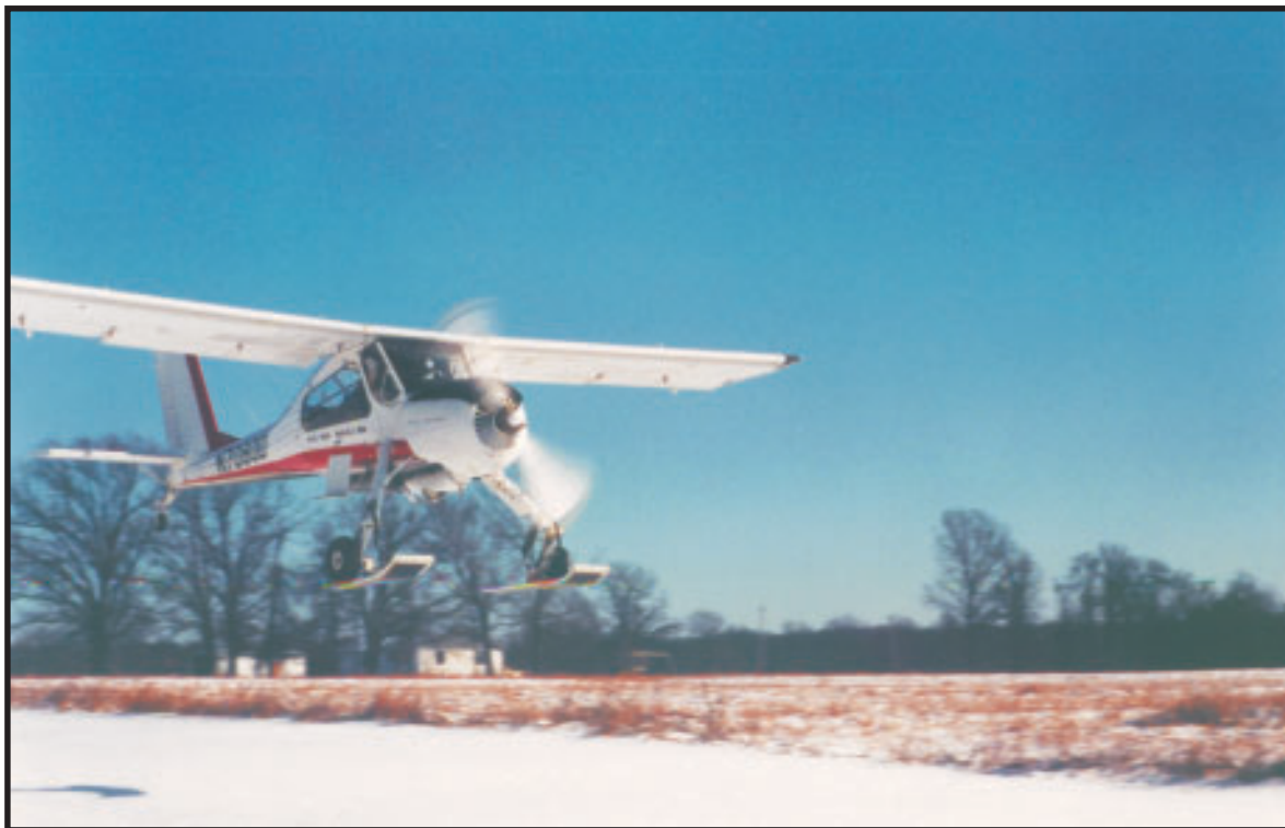
Paul and the Wilga make a photo pass at the Flying J Ranch airstrip near Tahlequah.

The AeroClub version can also easily be reconfigured for skydiving: the right-hand door is removed, the rear seats are removed and replaced with a bench-type seat, and the front passenger seat