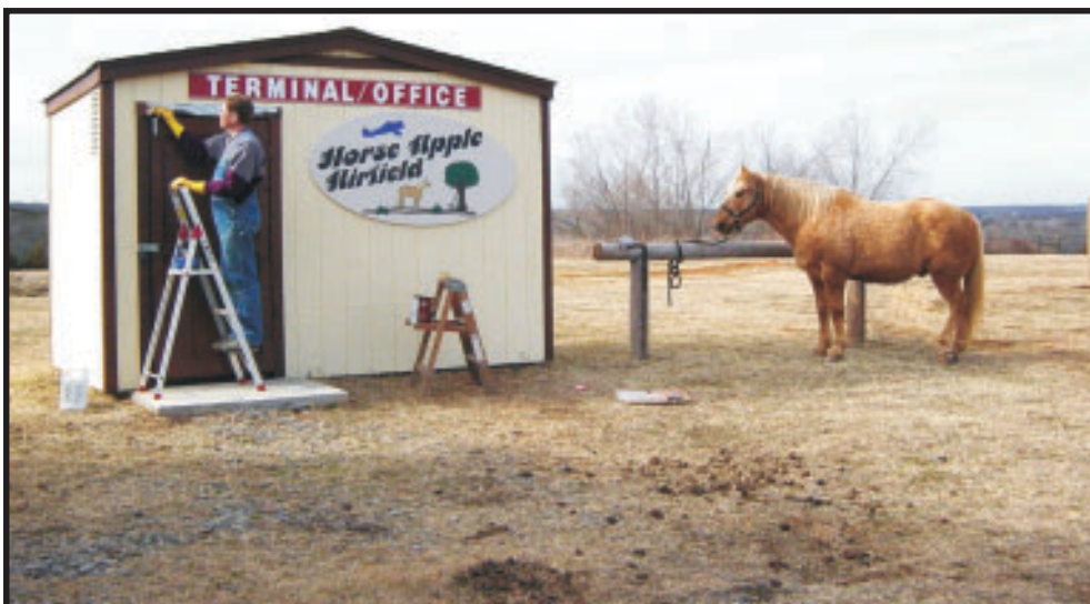
The newly remodeled HAA terminal building. The "courtesy car" awaits at the rail.